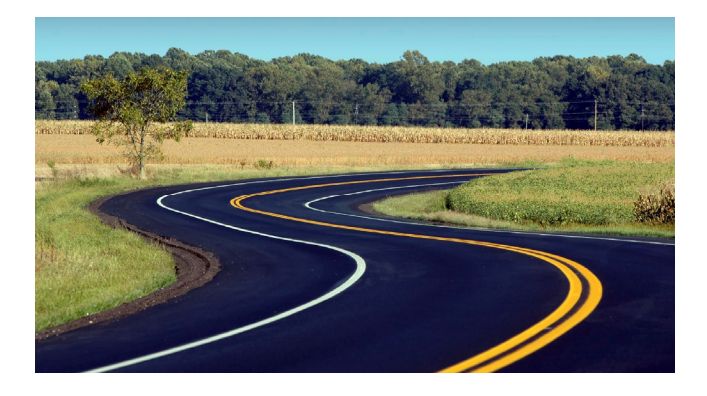
Figure 5. MARC recommends next steps for achieving tomorrow's green asphalts.

The authors, working for the University of Wisconsin Modified Asphalt Research Center (www.uwmarc.org), are mining published literature to raise awareness about opportunities in sustainable asphalt pavement development. Some of the promising ideas to move forward are: