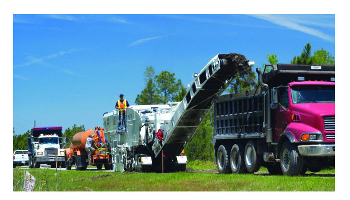
Figure 4. Asphalt is the most recycled construction product in the United States. The energy, emissions and environmental impact of recycling must be quantified.

The final process is pavement removal, recycling and disposal. Nearly 80 percent of all pavements are recycled, making asphalt pavement North America's most recycled construction product (15). One New Zealand study attempts to identify the primary reasons for the failure of the New Zealand road industry to adopt minimization strategies ( \delta ). The report concludes that waste minimization strategies, including recycling, are not widely employed because of a lack of experience on the part of the industry and little confidence in the use and performance of recycling technologies.